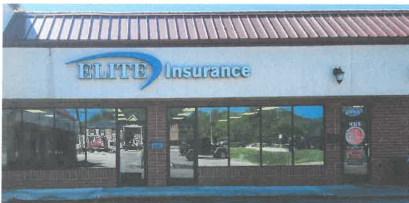
Old Picture 42 Linear Ft Store Front

NOTICE: ALL DRAWINGS AND CONCEPTS ARE THE PROPERTY OF SCHRAMM SIGNS UNTIL PAID FOR. UNAUTHORIZED DISTRIBUTION OR USE WILL INCUR A $500.00 DOLLAR CHARGE